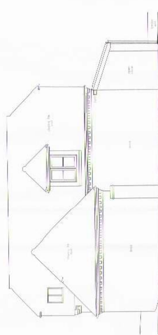
North east elevation